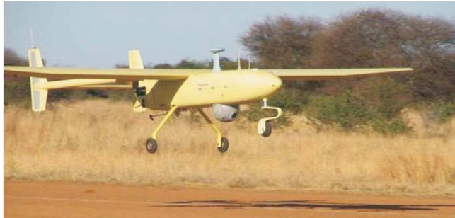
Engineering aspects of Denel Dynamics' Seeker UAV system are often discussed at the TAUSC.

The TAUSC is pre-eminently useful to certain categories of professionals, such as technology managers and acquisition experts (i.e. developers and users), research scientists and development engineers, and representatives from organisations that fund research and development.